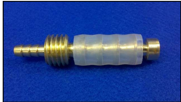
Figure 1. Assembled Vapor Pin™.