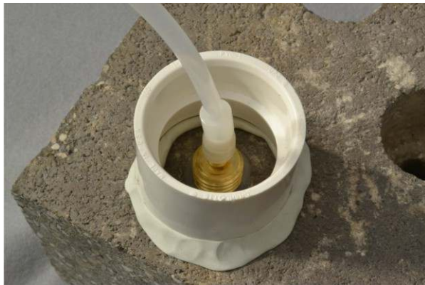
Figure 6. Water dam used for leak detection.

dam around the Vapor Pin™) Figure 6]. Consult your local guidance for possible tests.