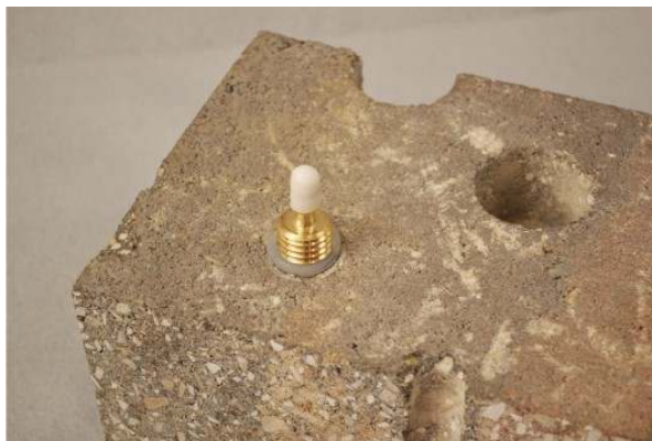
Figure 4. Installed Vapor Pin™.

During installation, the silicone sleeve will form a slight bulge between the slab and the Vapor Pin™ shoulder. Place the protective cap on Vapor Pin™ to prevent vapor loss prior to sampling (Figure 4).