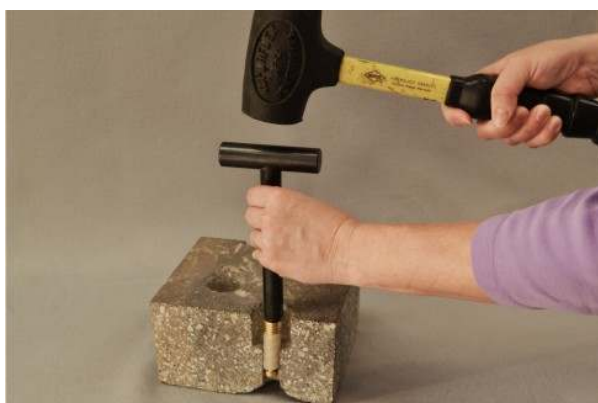
Figure 3. Flush-mount installation.

For flush mount installations, unscrew the threaded coupling from the installation/extraction handle and use the hole in the end of the tool to assist with the installation (Figure 3).