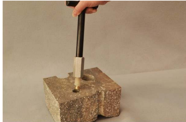
Figure 8. Extracted Vapor Pin™.

turning the tool to assist in extraction, then pull the Vapor Pin™ from the hole (Figure 8).