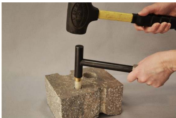
Figure 2. Installing the Vapor Pin™.

dead blow hammer (Figure 2). Make sure the extraction/installation tool is aligned parallel to the Vapor Pin™ to avoid damaging the barb fitting.